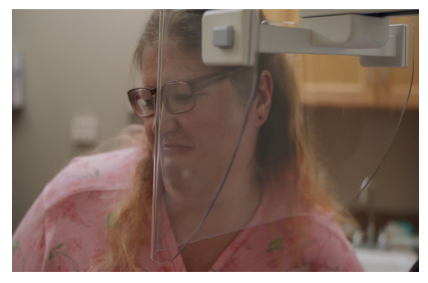
I stay very still to take the picture.