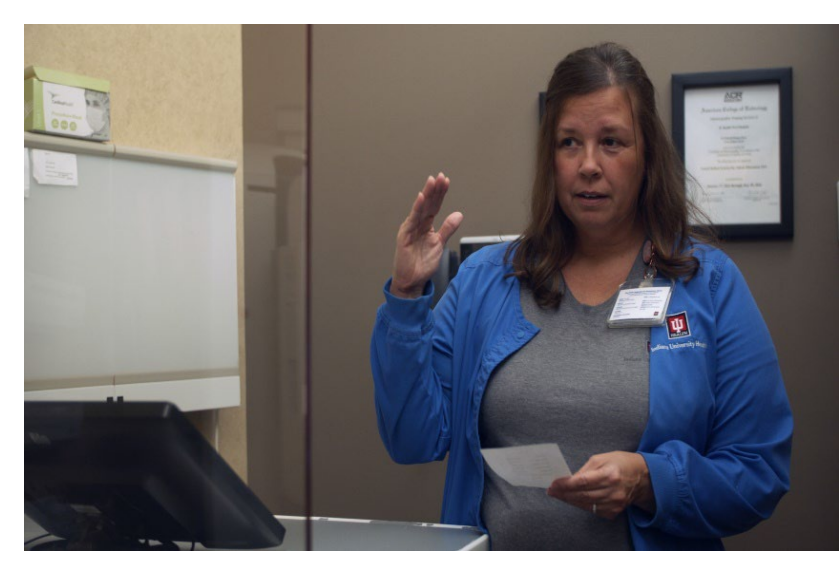
The tech brings me to the room.