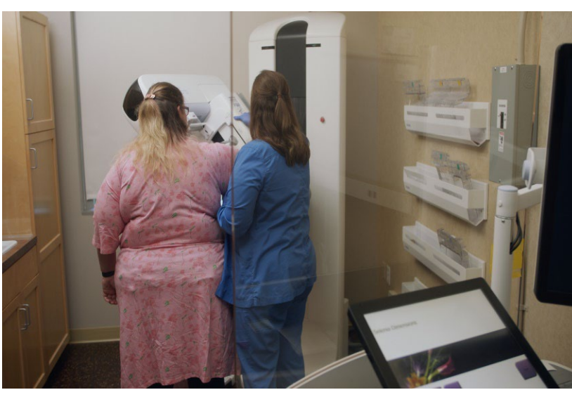
The tech helps move my breast onto the shelf.