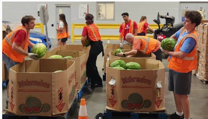
MIIs on the Indianapolis campus volunteer at Gleaners Food Bank for their Community Immersion Project during first-year orientation.